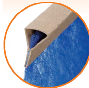
Pinch Frame Design