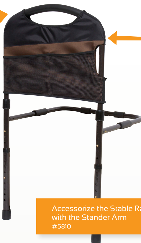
Accessorize the Stable Rail with the Stander Arm #5810