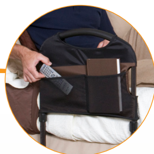
Includes a Bonus Organizer Pouch