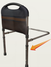
Attach Base Tubes to Main Handle