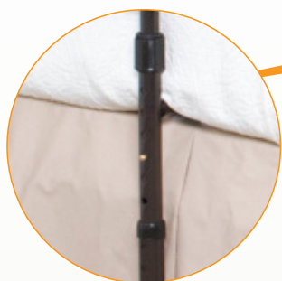
Adjustable Legs Provide Stability