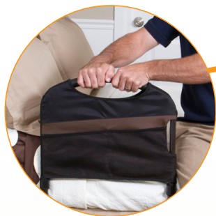
Accessible Handle Provides Support