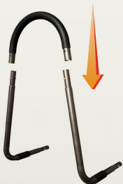
Attach Handle to L-tubes