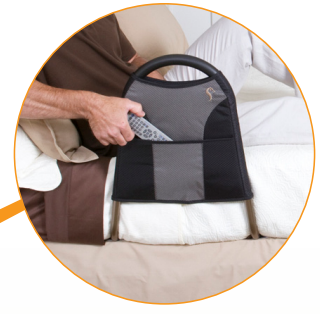
Includes Padded Organizer Pouch