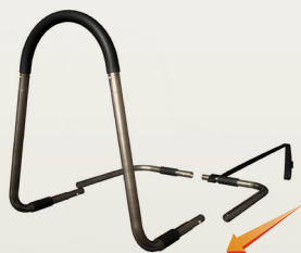
Slide On Safety Strap And Attach Base Tubes to L-tubes