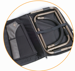
Easily Fits into Included Carrying Case