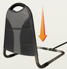
Slide on Organizer Pouch