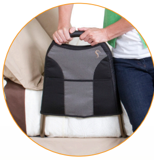
Ergonomic Handle Provides Support