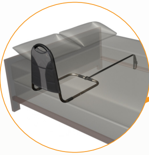
Secures to Any Home or Hospital Bed With Included Safety Strap