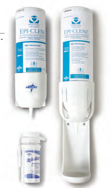
MSC097040, MSC097041 & MSC097042