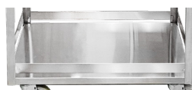
Shelf with 4 Guardrails