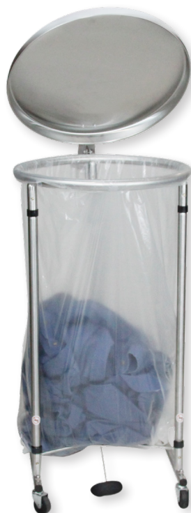
Disposable Water Soluble Plastic Hamper Bag