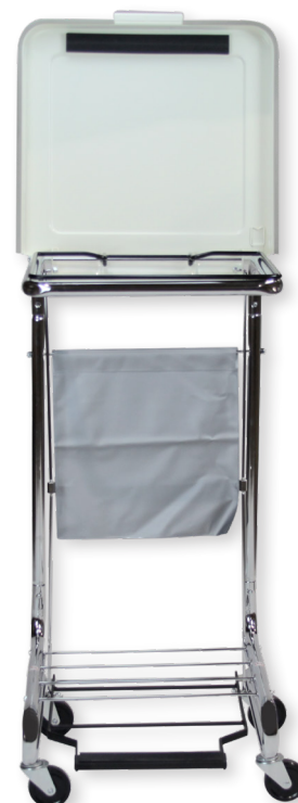
Secure Care Hamper Pouch