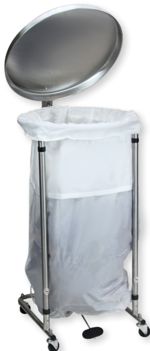
Reusable Nylon Hamper Bag