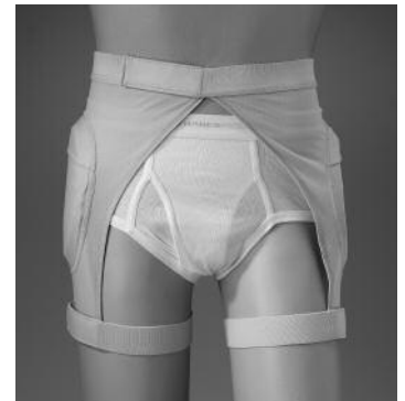
#6019 / #6019H