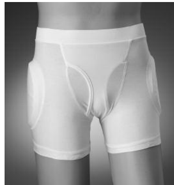
#6018 / #6018H