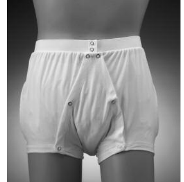
#6017 / #6017H