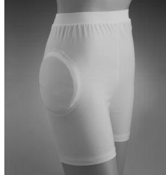
#6016 / #6016H