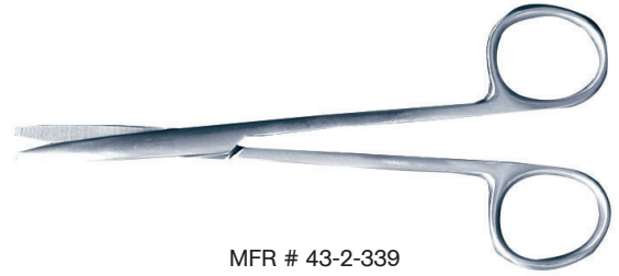
MFR # 43-2-339