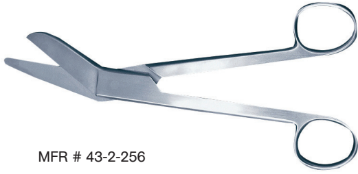
MFR # 43-2-256