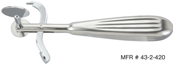
MFR # 43-2-420