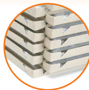
Pinch Frame Design