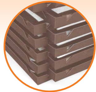
Notched Frame Design