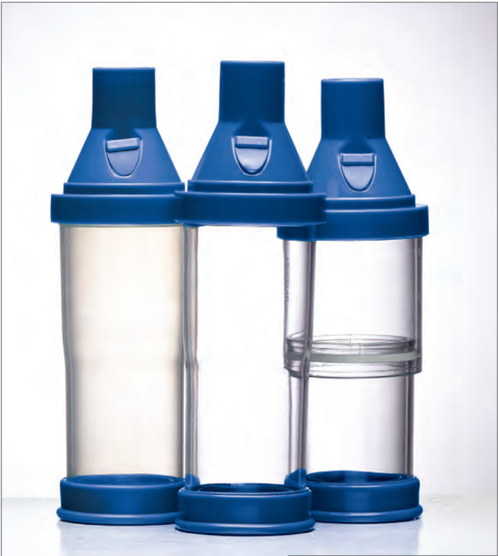
HCSA300, HCSA100, HCSA200