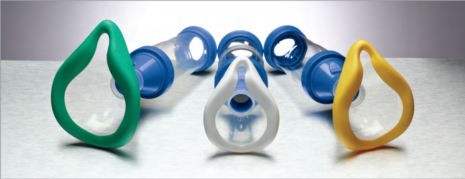
HCSA114, HCSA112, HCSA113hh

Adding a spacer to an MDI can increase medicine reaching the lungs by over 50%. 1