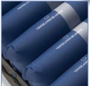
Ventilated low air loss air cells help manage moisture