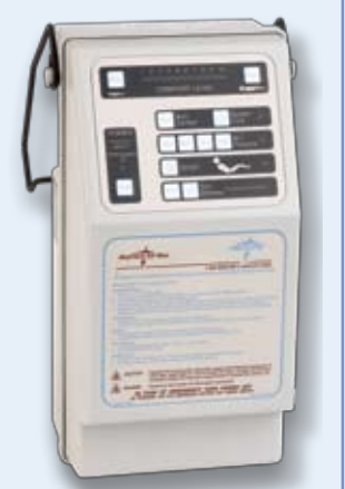
Medline MedTech Air Max System MDT24MEDAIRMX