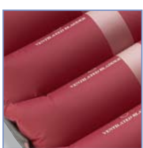
Ventilated low air loss air cells help manage moisture