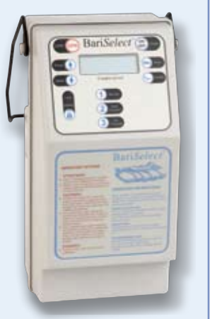
Medline Bari System MDT24B39, MDT24B42, MDT24B48, MDT24B54

Alternating Pressure (pulsation): Provides three cycle settings that continually readjust the system to ensure patient comfort