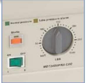
Weight dial makes set up fast and easy